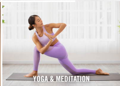
YOGA & MEDITATION