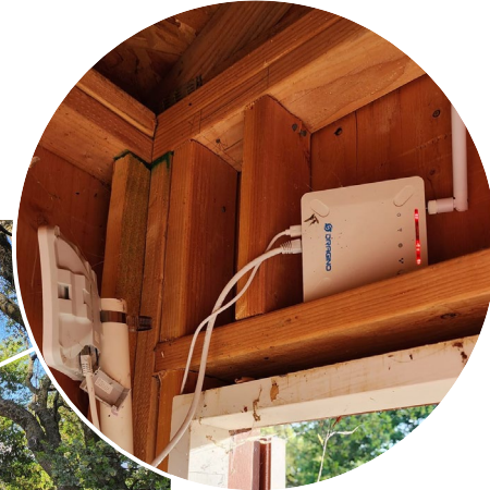
LoRaWAN setup in my well house